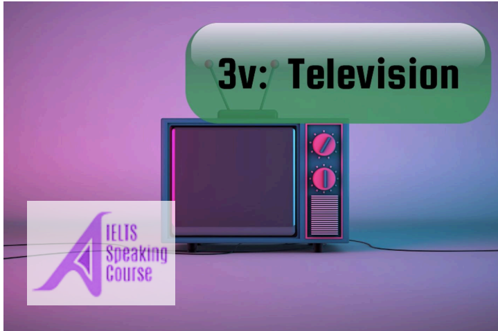
Lesson 1A: Yes/No Questions (1)