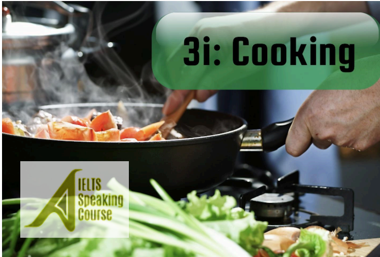
Lesson 1A: Yes/No Questions (1)